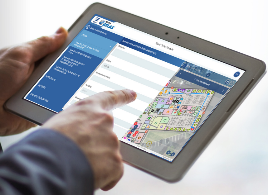
▲ Effortless Indoor Navigation at Your Fingertips

Arora ATLAS ® Indoor Maps offers a powerful solution for seamless asset management and indoor navigation. Streamline workflows, optimize resources, and enhance user experiences within complex indoor environments.